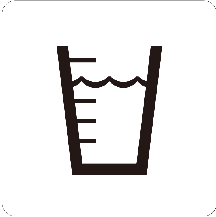
飲み物計量中 monitoring fluids