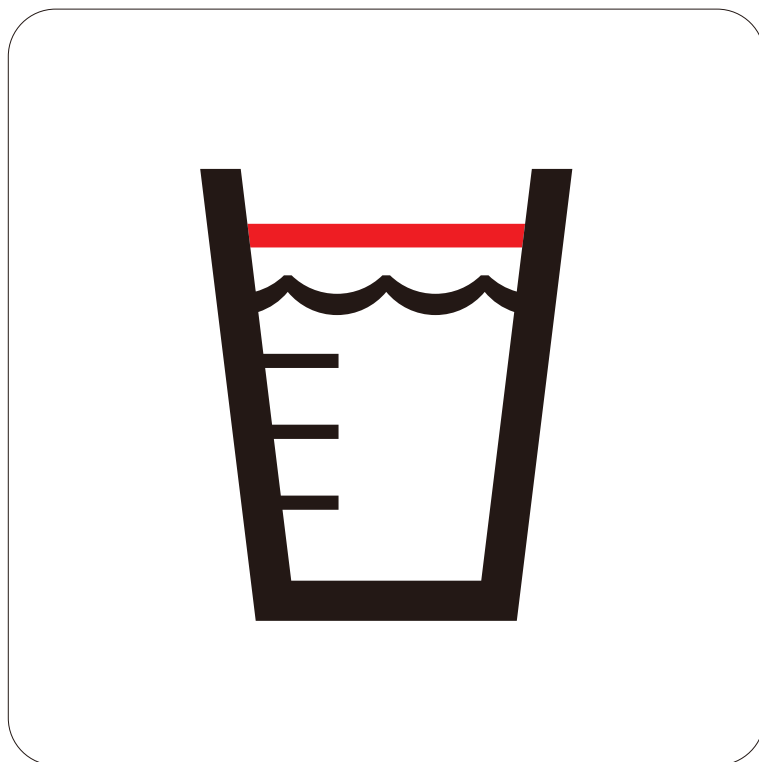
飲み物制限 limited fluids